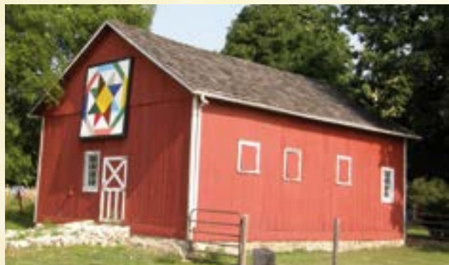
Perry Farm, 459 N. Kennedy Dr., Bourbonnais

The farmstead was given to the Bourbonnais Township Park District by the state of Illinois in 1990. This heavy timber barn was built to house horses and livestock around 1840, when the Durham family bought the land. Until the barn was built, the only structure erected was a wigwam that the Pottawatomi helped the Durham family build. Unchanged until around 1940, the barn had a makeover to house tractors and equipment. Recently the barn has been restored so that the exterior is almost the same as when it was first built. The pattern is a variation of an eight star design.