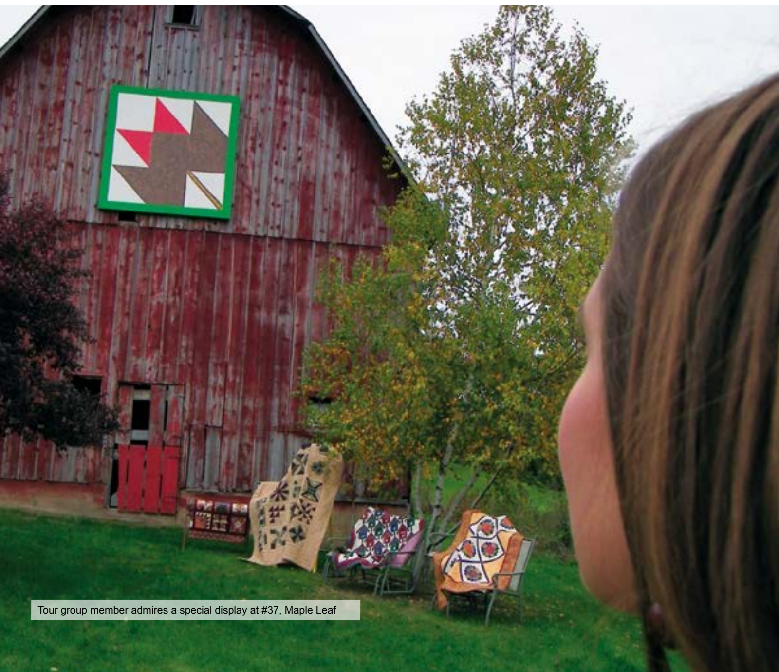
Tour group member admires a special display at #37, Maple Leaf