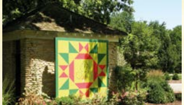
Kankakee County Museum 801 W. Water St., Kankakee