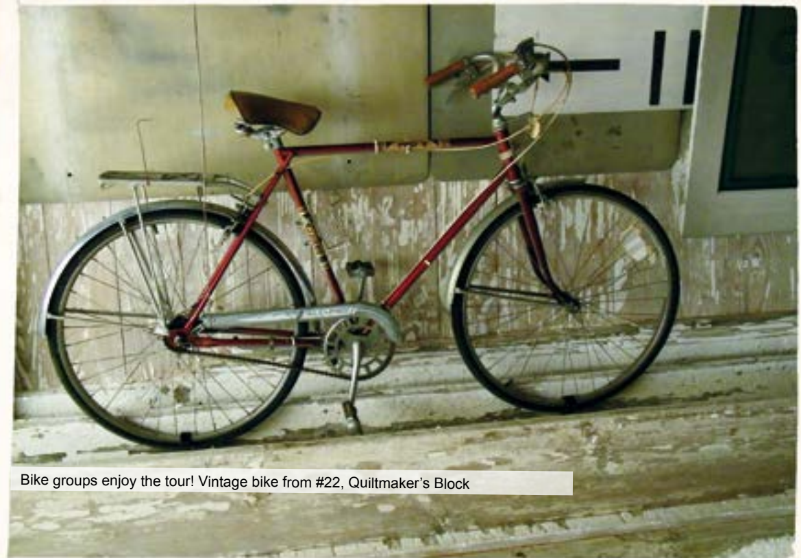
Bike groups enjoy the tour! Vintage bike from #22, Quiltmaker's Block