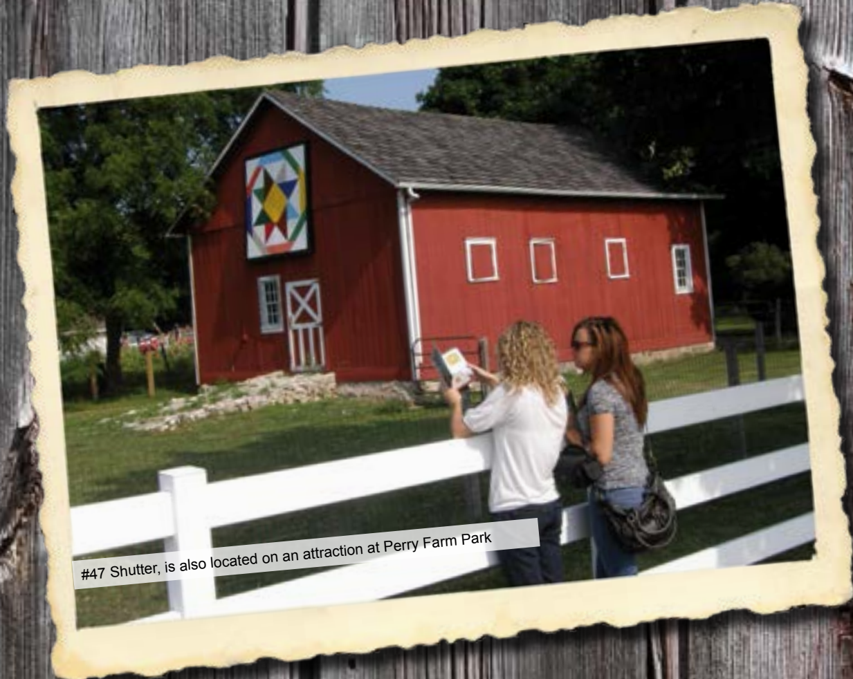
#47 Shutter, is also located on an attraction at Perry Farm Park