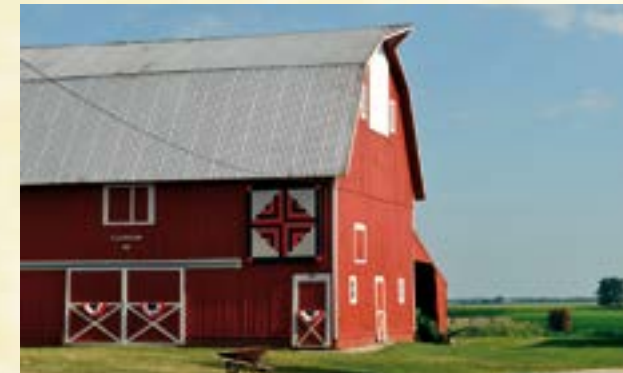
Riordan Family Farm, 15205 W. State Route 17, Reddick