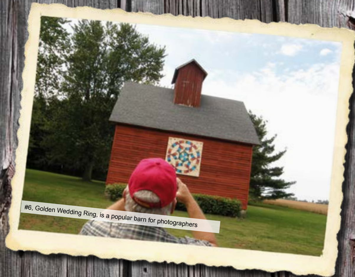
#6, Golden Wedding Ring, is a popular barn for photographers