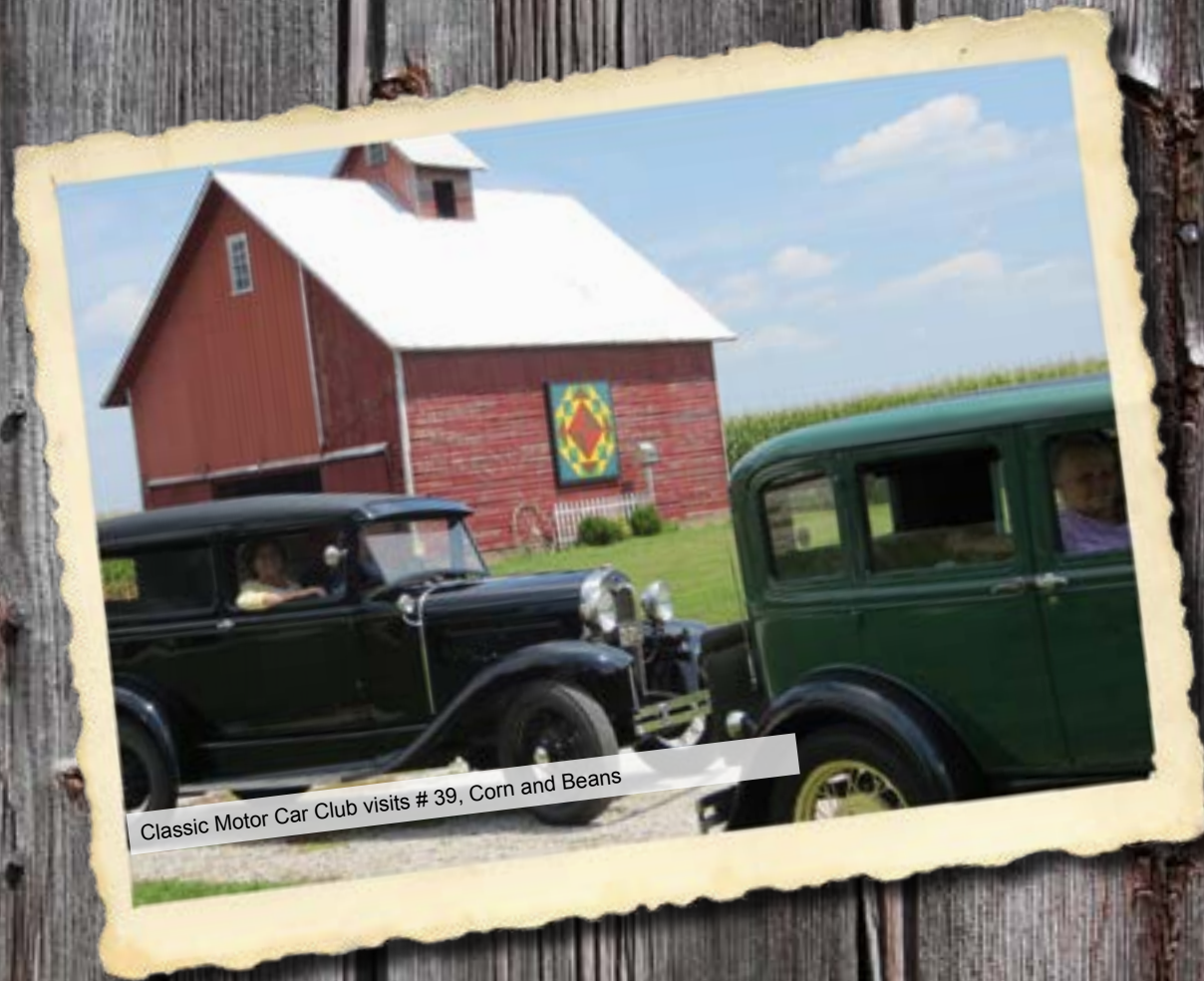
Classic Motor Car Club visits # 39, Corn and Beans