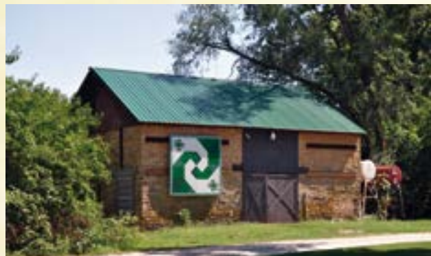
Camp Shaw 6641 N. 6000W Rd., Manteno

Beautiful Rock Creek flows through the camp which originally was home to Pottawatomi Indian Chief Shaw-Waw-Nas-See and the site of one of the oldest Pottawatomi villages. A generous offer by the Public Service Company of Northern Illinois in 1945 resulted in the 4H camp established in 1946. Today it offers traditional and new programming for youth and rental groups. The Snails Trails pattern is composed of squares and triangles pieced to give a dramatic result. This pattern has a colorful history of names; Indiana Puzzle, Monkey Wrench, and Friendly Hand to name a few.