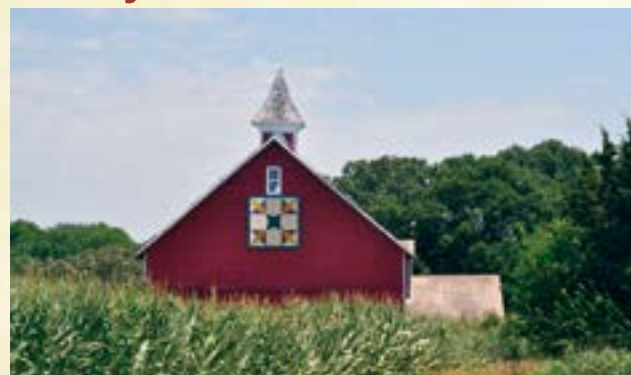
Small Family, Kankakee Daily Journal, 2000 W. Route 113, Kankakee

The Daily Journal, a locally owned newspaper started by the Small family, has been the owner of this barn since 1940. The pattern Turkey Tracks was known as "Wandering Foot". However, legend has it that if a young man slept under a Wandering Foot Quilt he would never settle down and have a family. Thus, it began to be called Turkey Tracks instead. Today wild turkeys roost around the Small barn and making the Turkey Track pattern a fitting choice for this barn.