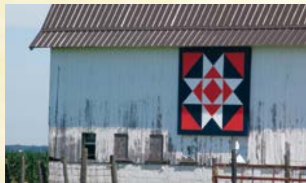
Phil & Kristi Moritz, 19081 W 5500S Rd., Buckingham

The farm was purchased around 1947. The barn was built of wood and concrete in 1949 by multiple family members and friends. It was originally a cattle barn. Multi-generation Illinois State Fair Grand Champion Steers and Bulls have been raised in this barn. Now the barn houses champion steers and hogs. The current owners, Phil and Kristi Moritz, are the third generation to live on the farm. In the summer months, one can see cattle and horses grazing in the pastures and show hogs being walked in the yard. The Card Basket is a version of the Card Trick Block, very popular in the 1950's.